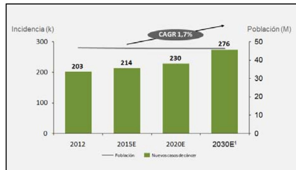
Cancer incidence and Spanish population